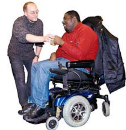
50 Hours per week

Many of them care for more than 50 hours per week.