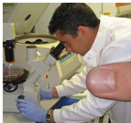
Funding for laboratory equipment

The haematology trials fund has provided salary support in the last 12 months for a research registrar working on new treatment for graft versus host disease after bone marrow transplant. This salary is now provided by the Leukaemia Research Fund following a successful grant application. The fund has also provided £60,000 for myeloma research and data manager funding. Smaller sums have been used to fund the travel of consultants, registrars and laboratory staff to national and international meetings.