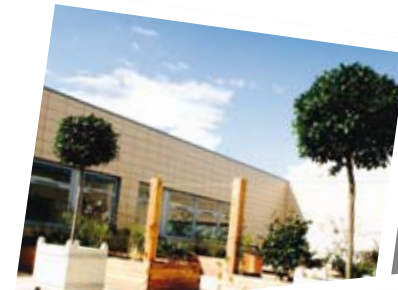
Cancer Centre Garden

In May 2008 the Kay Kendall Leukaemia Fund confirmed a grant towards the new Cancer Centre to buy a robot for Pharmacy and to equip and furnish a day room for haematology patients.