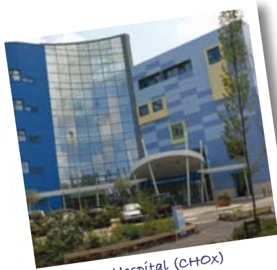
Children's Hospital (CHOx)

The Benefactors' Board, consisting of community supporters, parents, clinical representatives and members of the fundraising team will meet four times a year, and play an important role in developing fundraising strategy and making recommendations to the Charitable Funds Trustees as to the use of the Fund for Children.