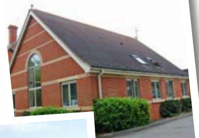
Brodey Centre (Horton)