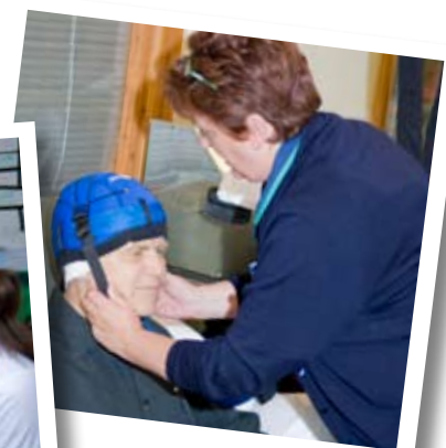
Staff on The Jane Ashley Unit